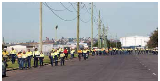
Orica workers practicing the site evacuation drill