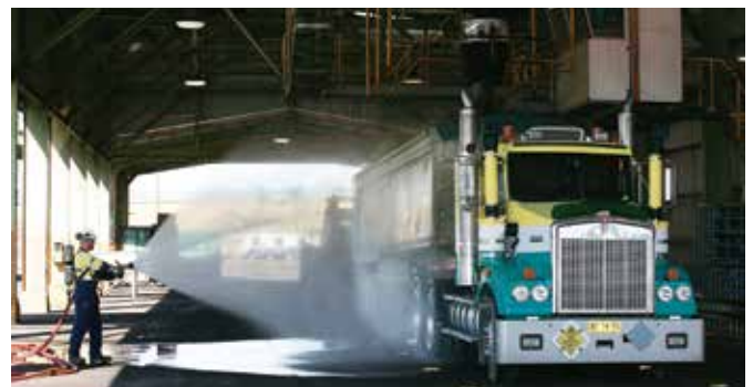
An operator taking part in the emergency exercise

More than 150 people were involved in the drill, which lasted around two hours. Exercises such as this one ensure that Orica staff can effectively execute the site's emergency procedures and continue to strengthen relationships with emergency services personnel. They also provide an opportunity for emergency responders to familiarise themselves with the facility and any potential hazards.