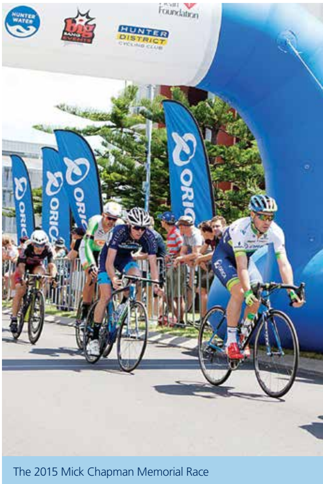
The 2015 Mick Chapman Memorial Race

Please visit nsw.cycling.org.au for more information.