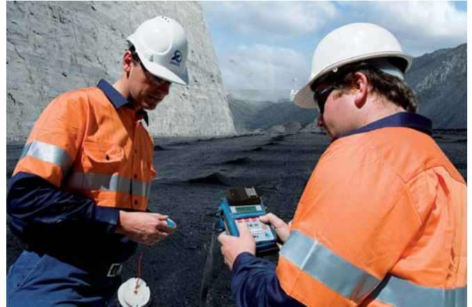
Logger dock makes pre-logging quicker and easier.