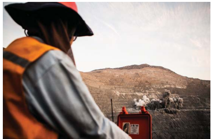
Initiating blast with Blaster 2400 (firmware upgrade to hardware).