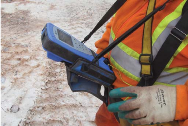
Faster programming time with Logger II (500 detonators).