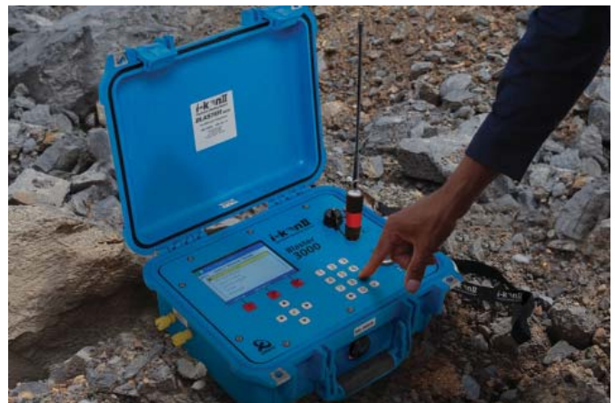
Initiating blast with Blaster 3000.