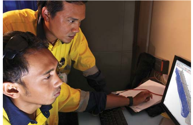
SHOTPlus™ 5 is the cornerstone of i-kon™II.

These outcomes can be further enhanced when used in combination with Orica's range of blasting products and tailored services.