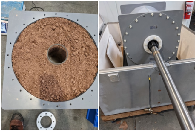
Image 1: lab test setup including the test vessel during filling (left) and during WIREBmr™ insertion (right).

The findings in figure 1 illustrates the successful characterisation of saturation by employing WIREBmr™ during this laboratory-scale demonstration. Accordingly, it is possible to greatly increase the understanding of the saturation state, as a large component of liquefaction risk, of a tailings storage facility through the application of WIREBmr™ supported by laboratory analysis.