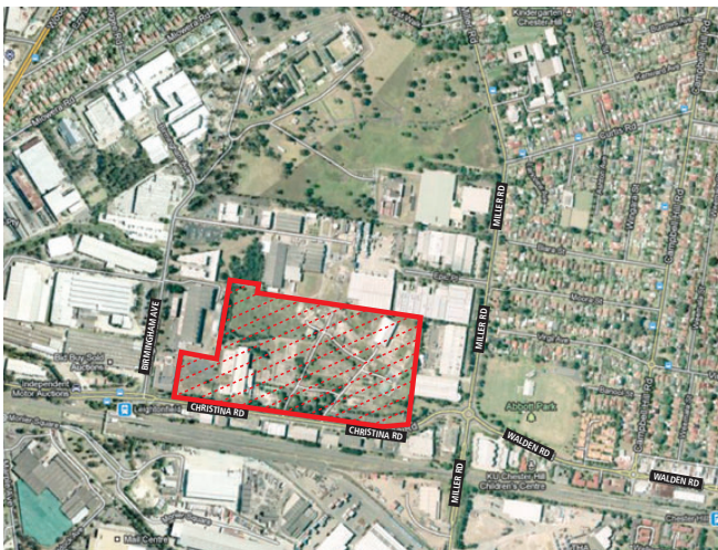
The location of Orica's Villawood Site