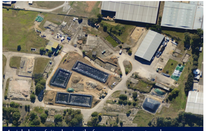
Aerial photo of site showing the four water treatment ponds and other infrastructure